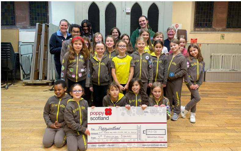
3rd Bonnyrigg Brownies with cheque for Poppy Scotland