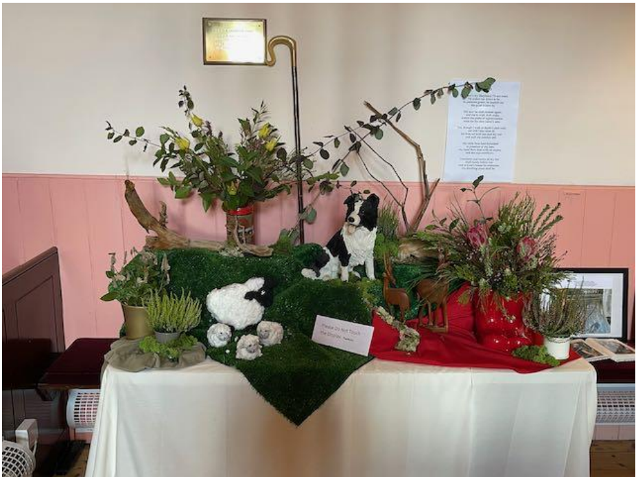
“The Lord’s My Shepherd”