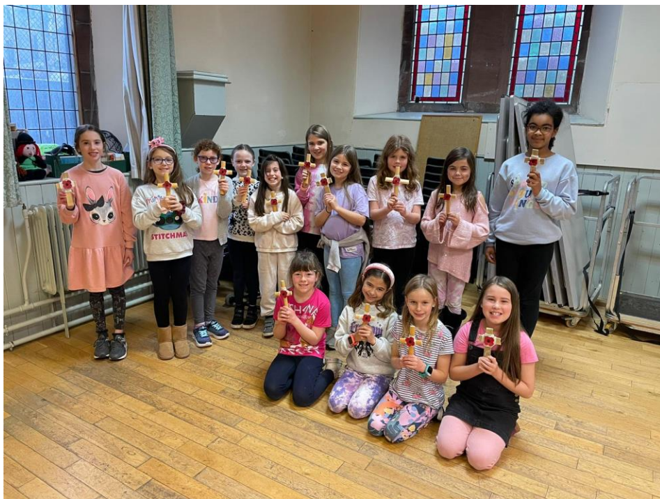
Crosses made for War Graves by the Brownies

Thank you and well done to all the Brownies.