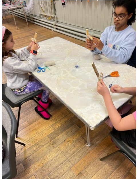
Brownies busy making Crosses for War Graves